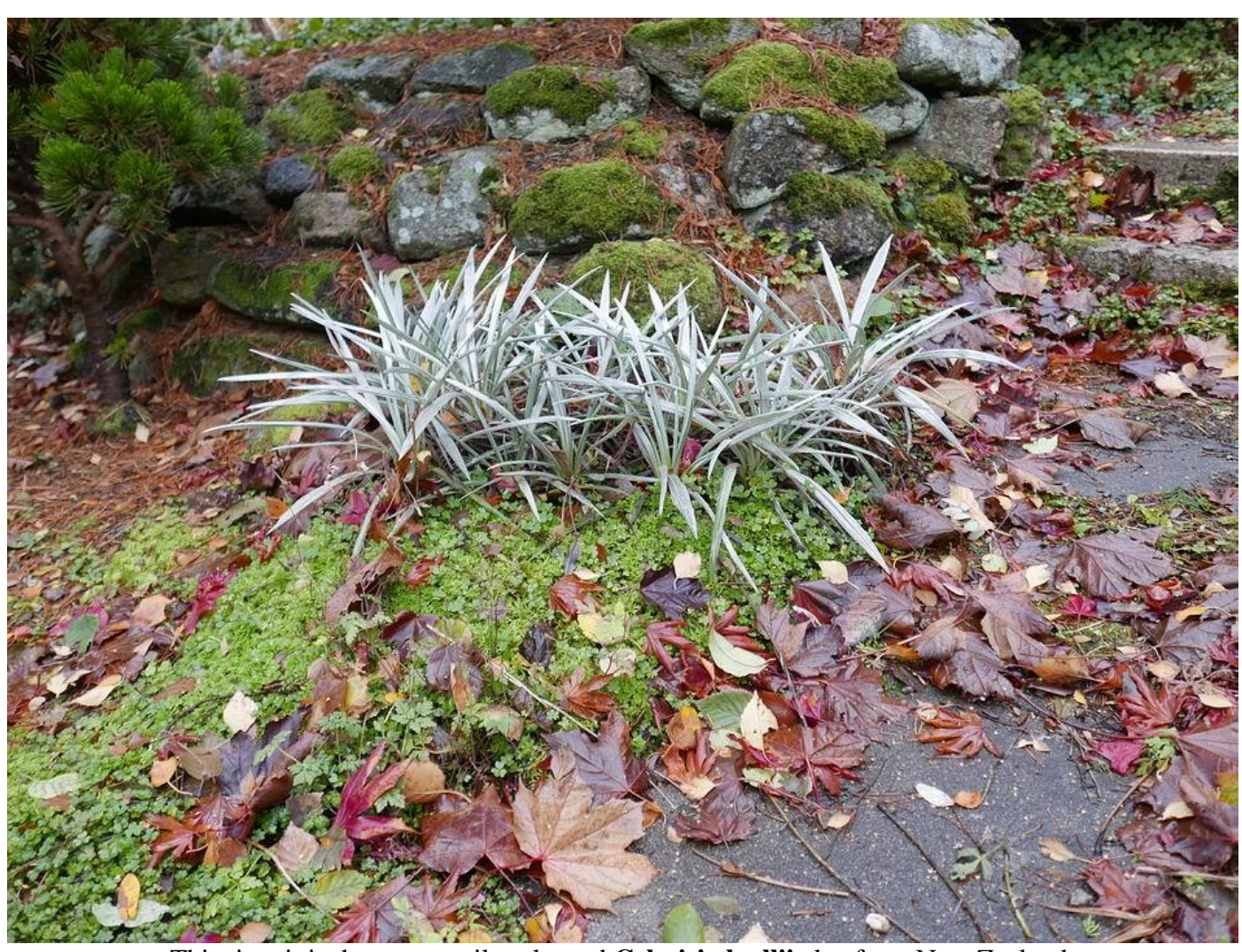
This time it is the narrow silver leaved Celmisia lyallii also from New Zealand.