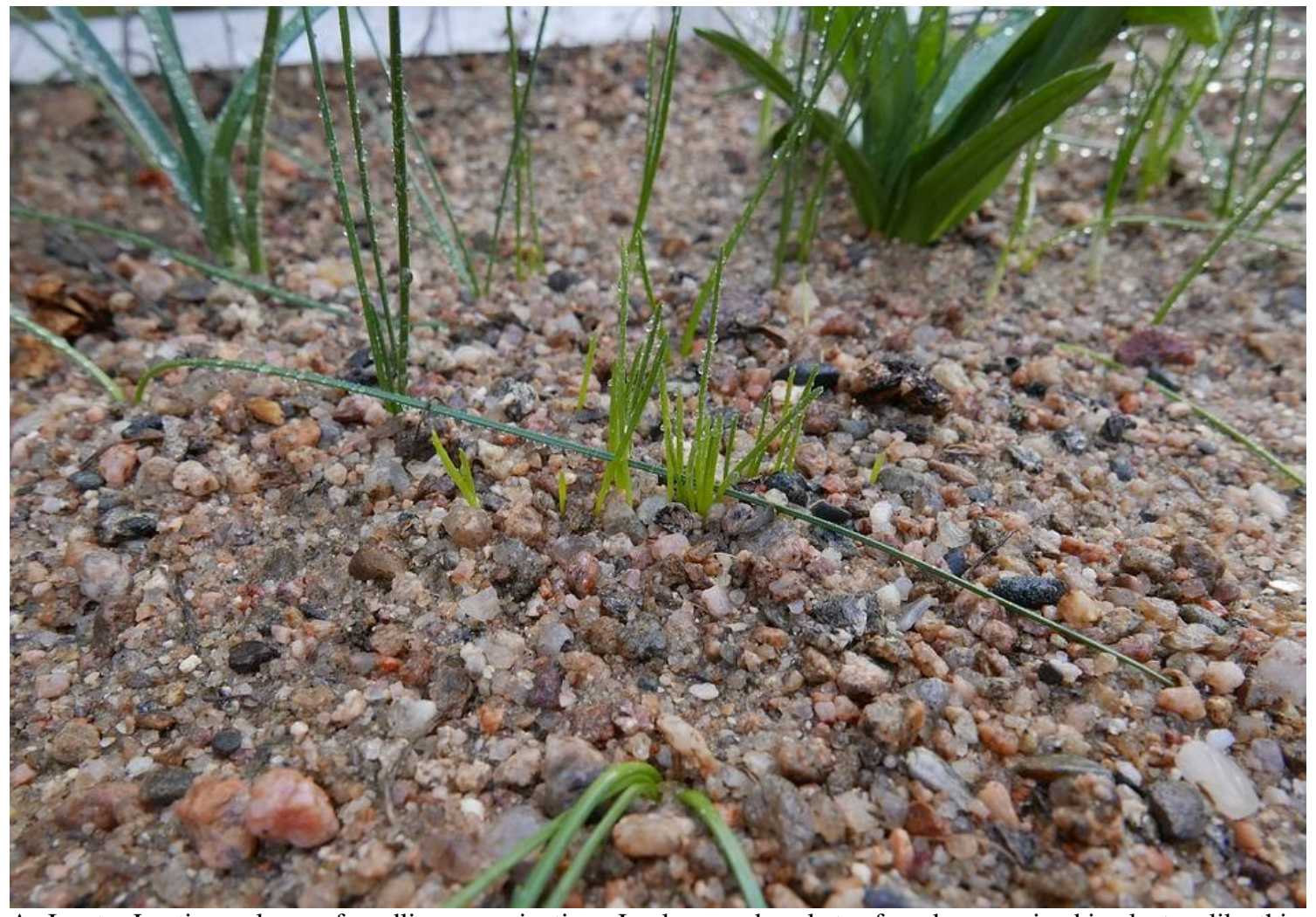
As I water I notice a clump of seedlings germinating. I only sowed packets of seed we received in clusters like this and took a reference picture at the time of the seed packet in position so I will need to check back to identify what these are, alternatively I can wait until they flower in a few years' time.