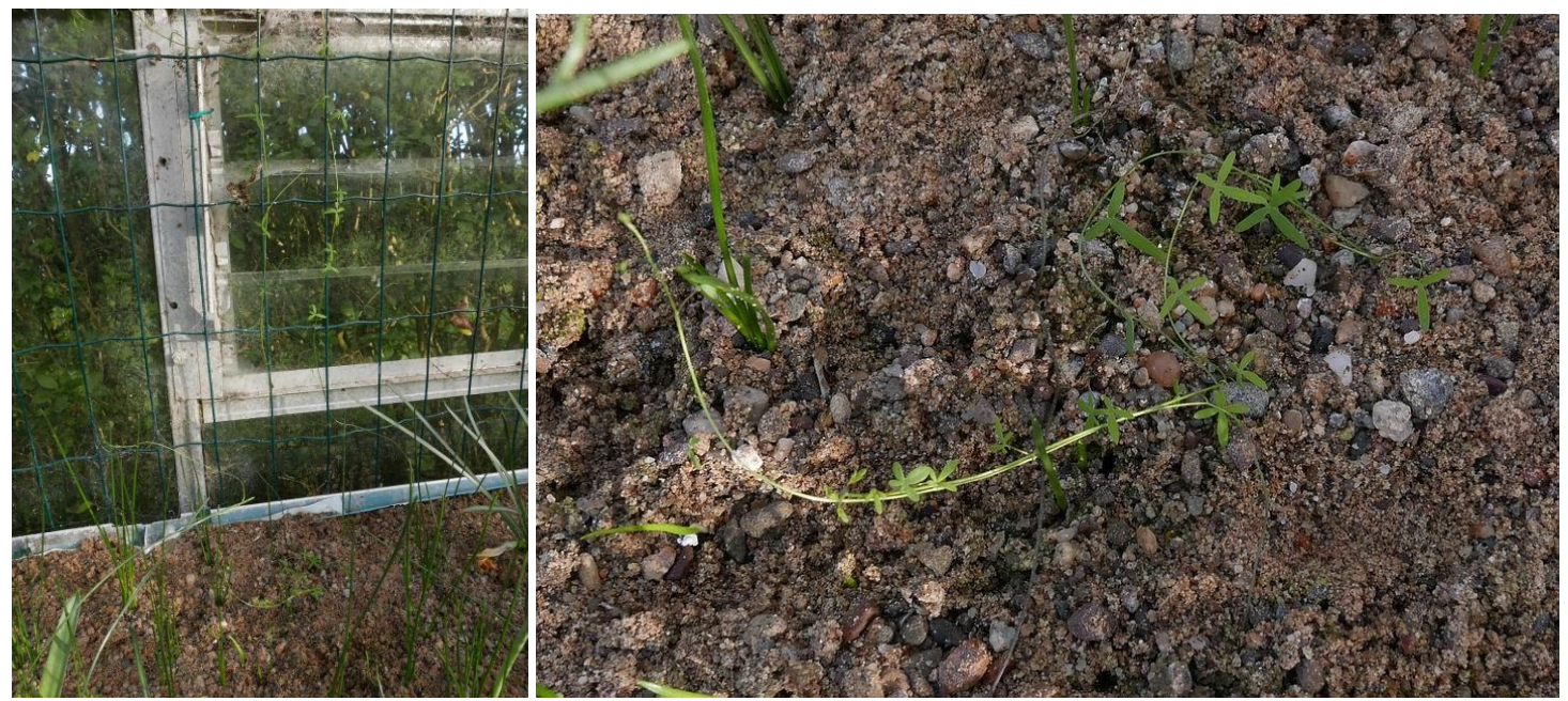
Some of the Tropaeolum azureum seedlings that germinated last year have come back into growth but I am disappointed not to see more as many more had germinated. All seedlings have a variation in the timing of growth so I may be premature and they may yet appear however they also have a variation in the conditions that they can tolerate so they may not all have survived in this sand bed. Growers can take advantage of this natural variation in tolerance by collecting and sowing seed from the plants in your garden then in turn collecting seed from those surviving seedlings—then every subsequent generation you raise will have further adapted to your weather and growing conditions.