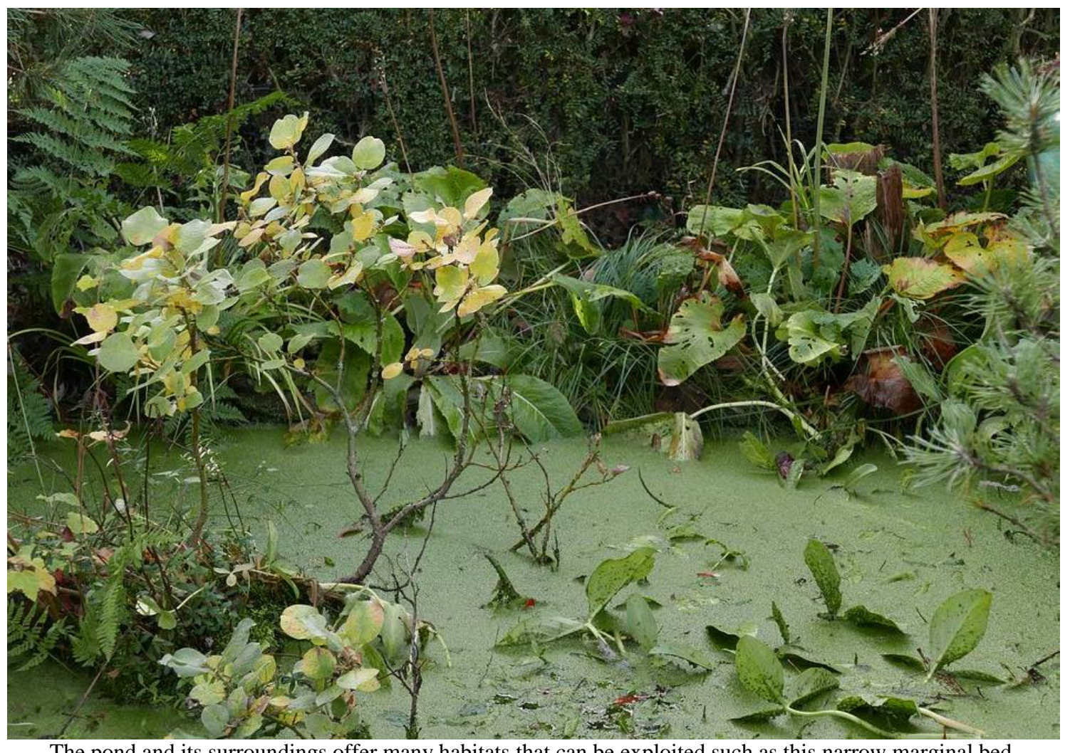
The pond and its surroundings offer many habitats that can be exploited such as this narrow marginal bed.