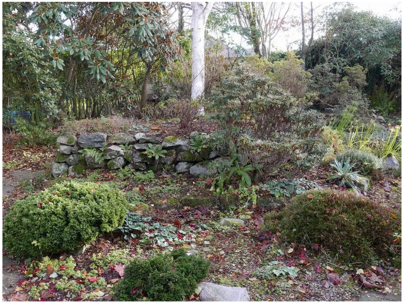
This is one of a number of raised beds in the garden where in addition to the plants on the top level I have also planted into the gaps between the rocks of the wall which provide alternative environments.