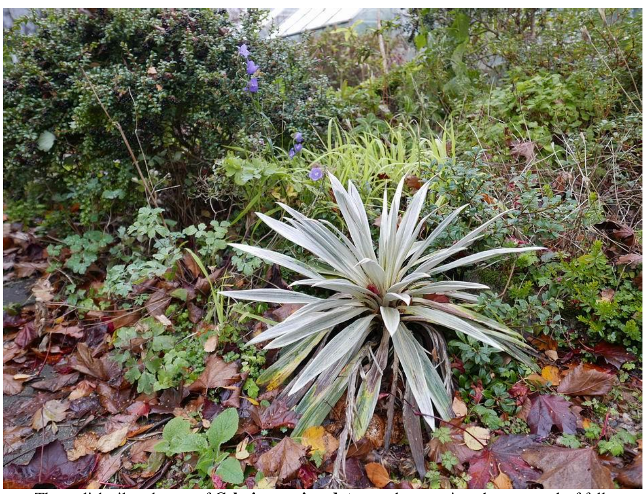
The stylish silver leaves of Celmisa semicordata stand out against the autumn leaf fall.