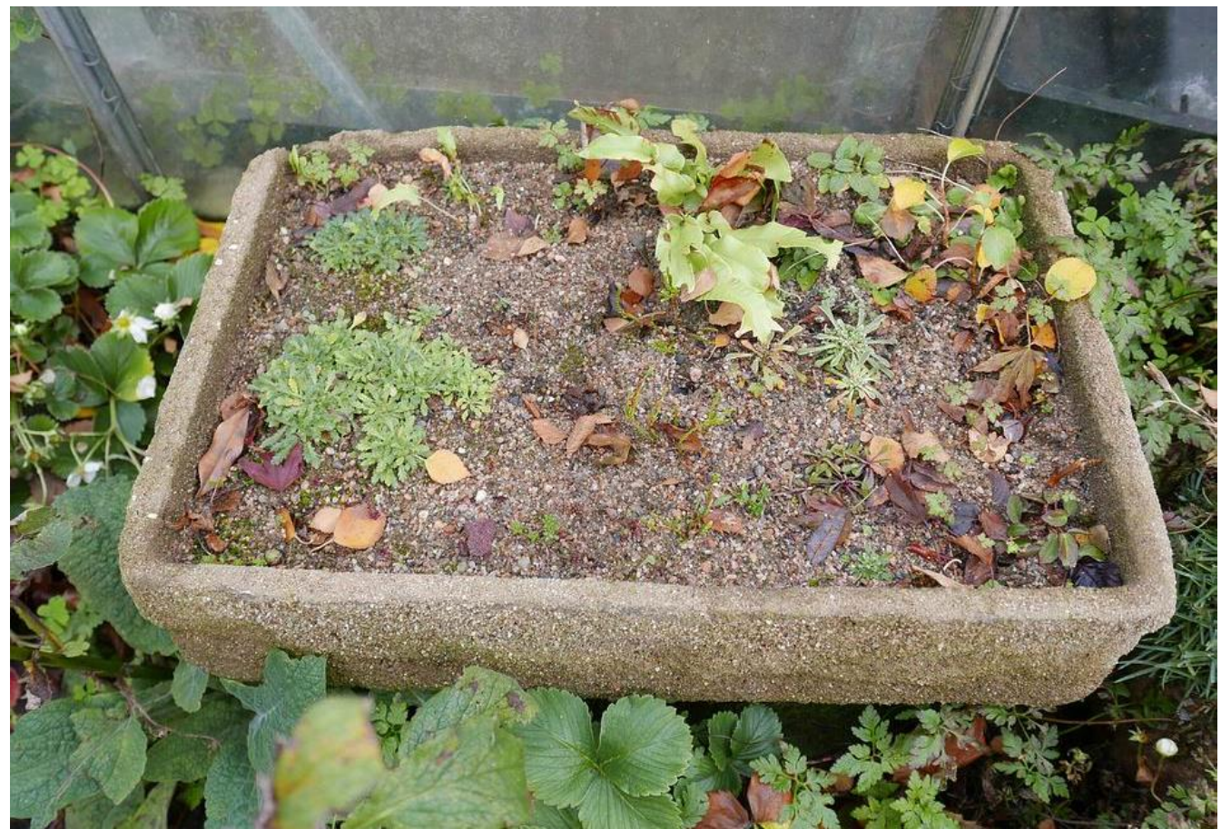
I always have a number of fish box troughs filled with only sharp sand which provide the ideal habitat where I can place cuttings to root - in addition I will occasionally scatter some seeds such as some Erinus alpinus (from a particularly nice colour form) seen above.