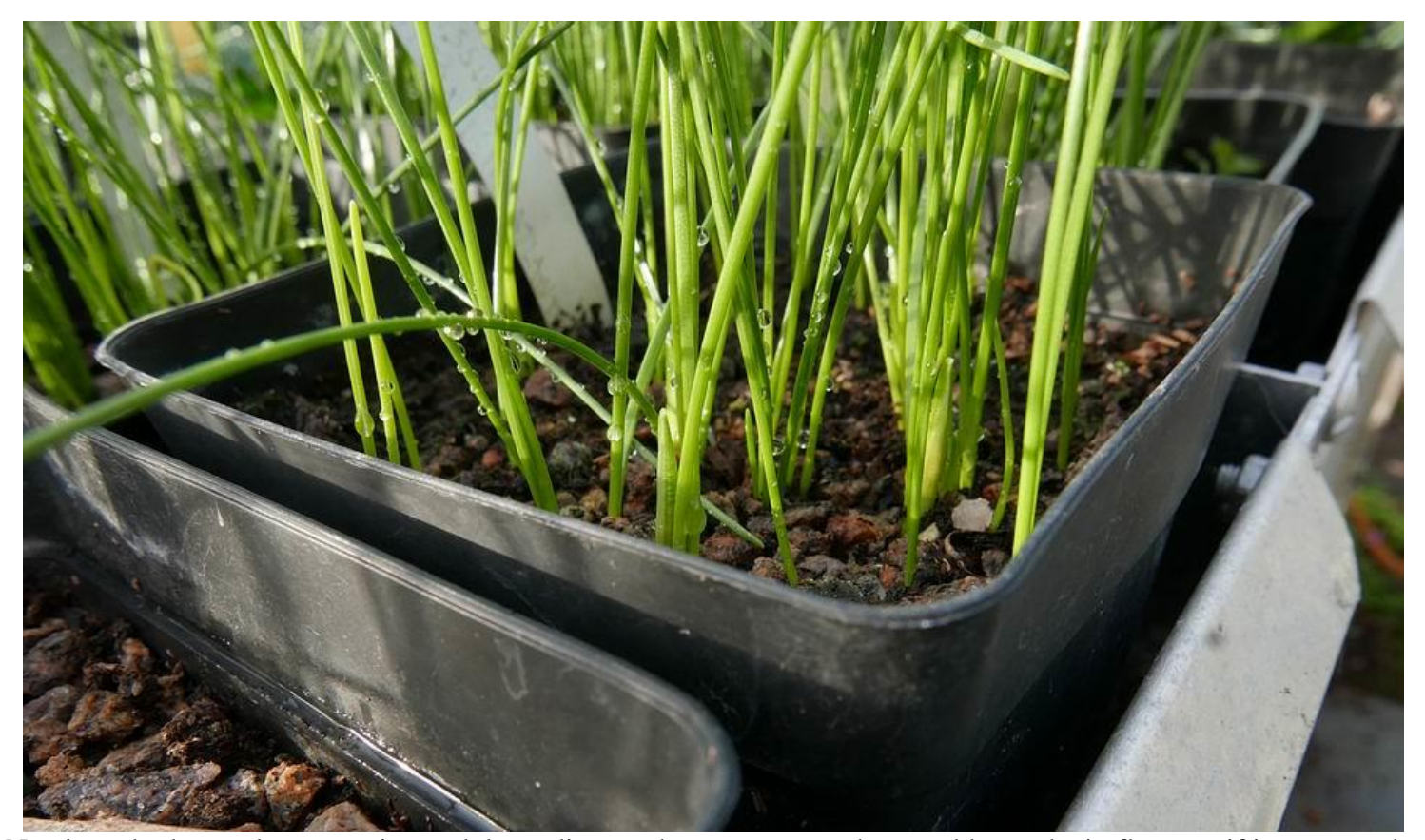
Narcissus buds are also appearing and depending on the temperature they could soon be in flower – if it stays on the mild side the flowers will open soon if it drops closer to or below freezing they will stay tight in their buds.