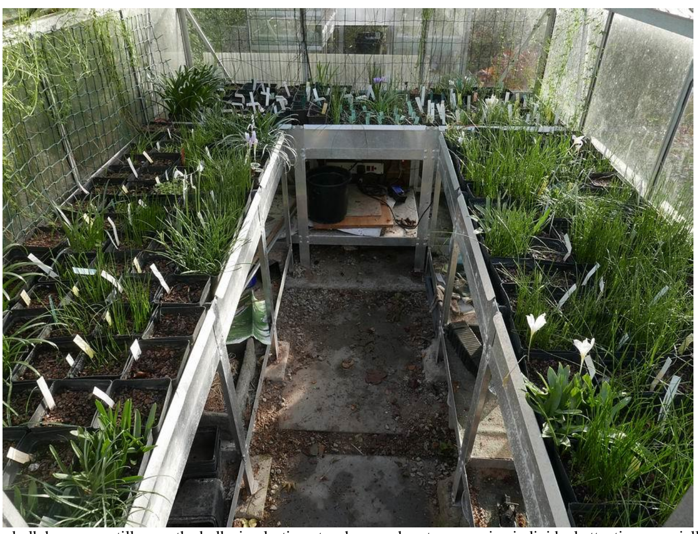
In the bulb house we still grow the bulbs in plastic pots where each pot can receive individual attention especially regarding watering. In some pots the leaves are well advanced and it is important to keep sufficient moisture available to support this growth.