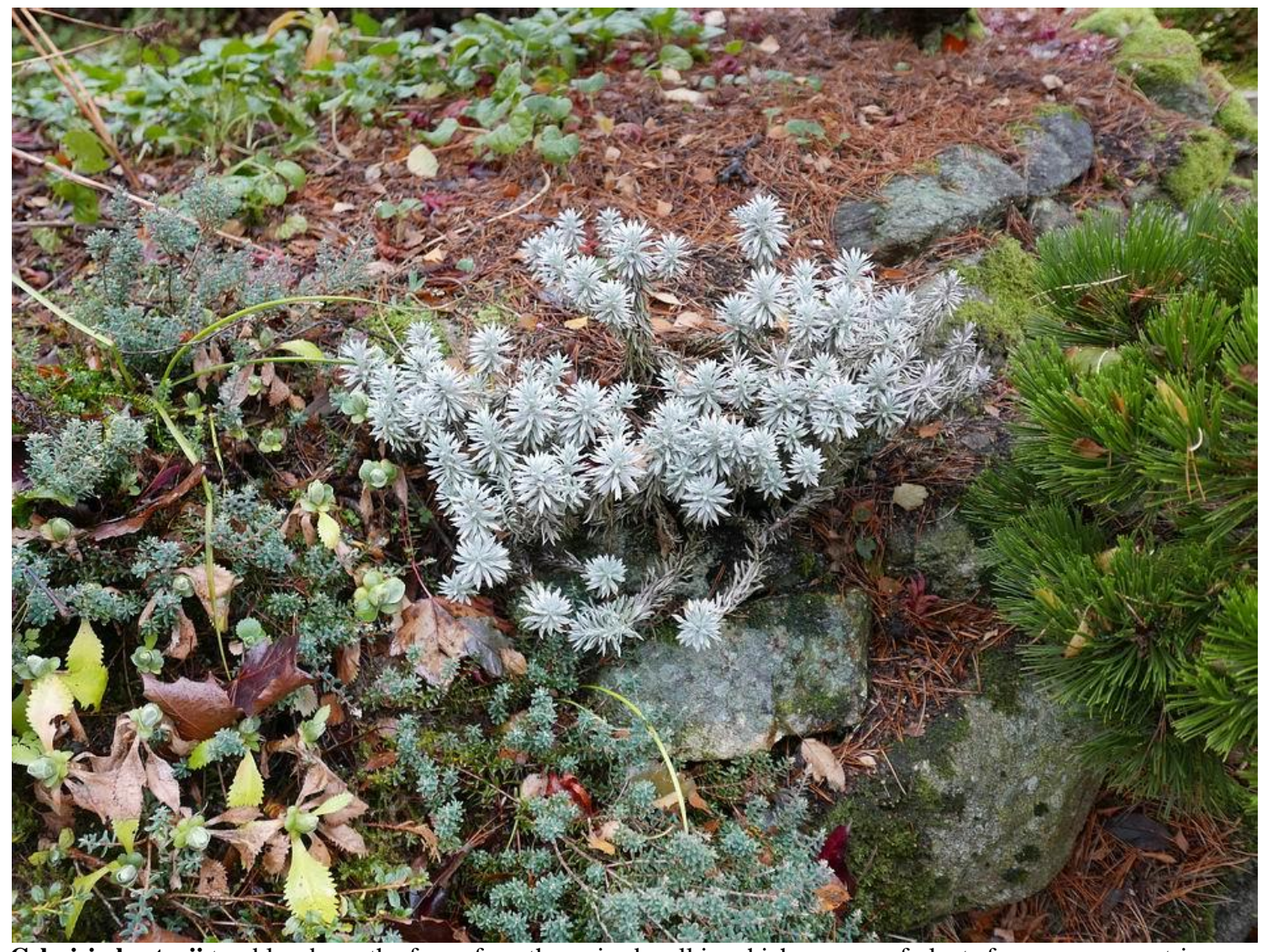
Celmisia hectorii tumbles down the face of another raised wall in which a range of plants from many countries are successfully growing.