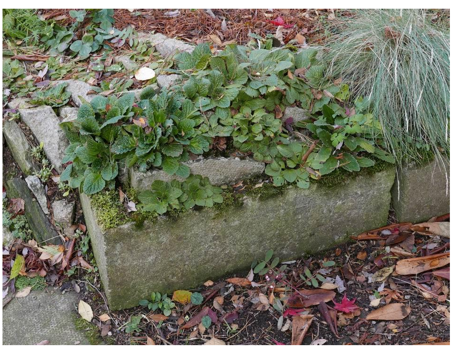
Ramonda (and Haberlea) can adapt to a trough where I have manipulated broken paving slabs to mimic the conditions, if not the looks, of its rocky Pyrenean habitat.

Even within a small trough there can be multiple micro-habitats. This is especially the case if you have a landscape of rocks raised well above the sides; then you will have North, South, East and West aspects, with drier conditions for plants near the top and moister for those planted near the rim. The roots of all the plants can explore down into the cooler moist conditions deep below the rim.