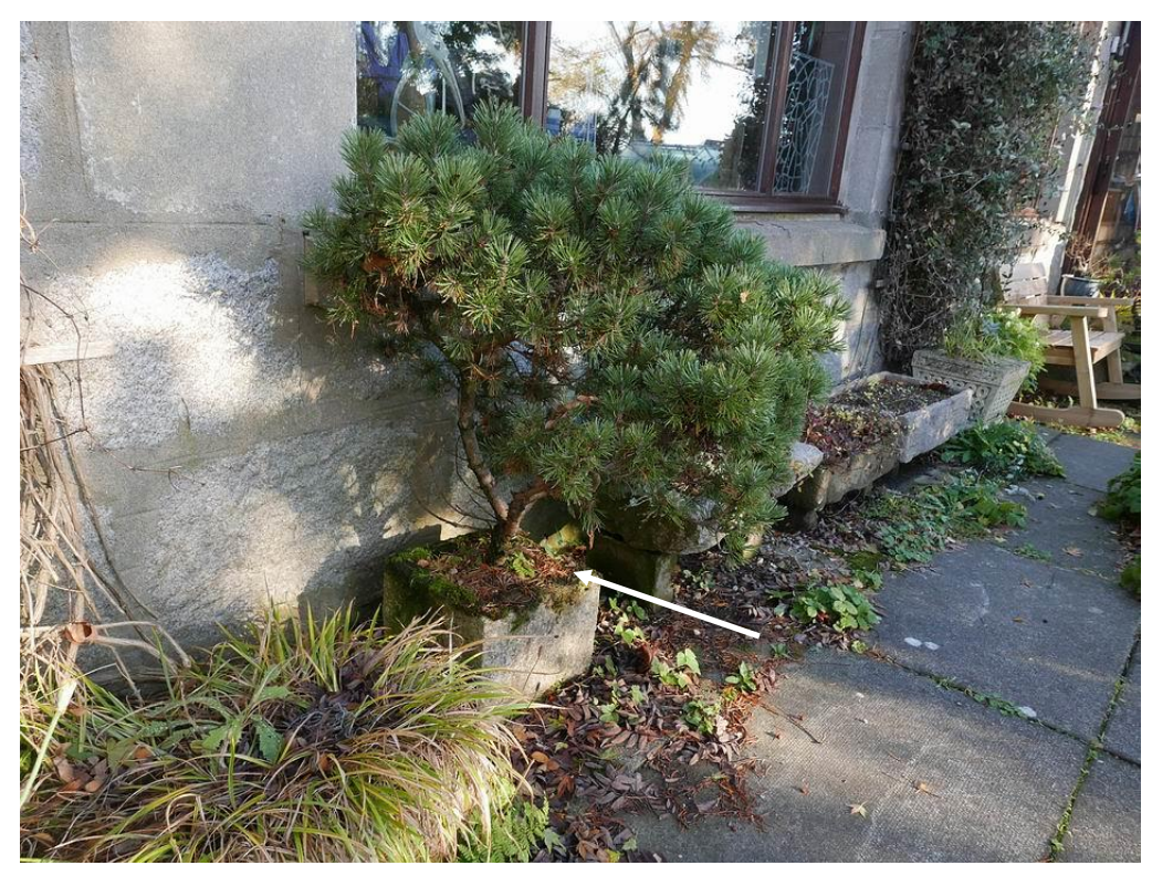
a pine growing in a concrete container.

When given the freedom to seed around plants choose their own habitat and sometimes with surprising results.