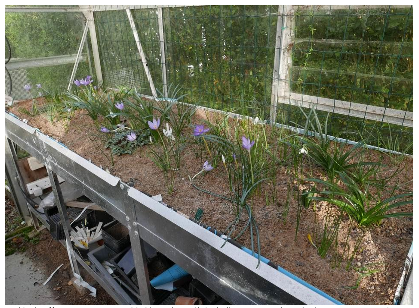
The sand beds offer a more communal habitat where all the bulbs get approximately the same treatment however even in this single bed there are slight differences where some areas stay moister longer. The reasons behind this are the amount of direct sunlight causing evaporation varies, also the differing amount of leaf growth use up the moisture at different rates, then in some places drips of condensation and or leaks from the joints on the roof add to the moisture levels.